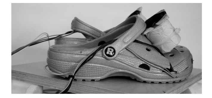
Figure 2. A pair of sabots with sensors in the soles. The loudspeakers are fixed to the shoes instep.

The audio display is provided by two 4\Omega Visaton FRWS5 loudspeakers, which were chosen for their low weight and small dimensions. Each speaker is attached onto a shoe, on the surface of the instep. By employing the laptop battery to power the acquisition and computation systems, plus a 9V battery to supply the small loudspeakers, the problem of wearability is addressed. On the other hand, in order to make the system wearable, the loudspeakers have to be small and light, this way raising problems of poor sound quality especially at low frequencies. This problem is addressed by enhancing the system with a portable subwoofer.