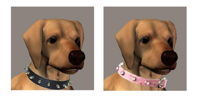
Figure 1 Avatars used in study: Roxy and Rocco

Viewers were directed a website where they gave their consent to participate and completed a pre-test questions. Participants were randomly assigned to either a masculine or feminine avatar condition. Realism and anthropomorphism were held constant and only the gender of the avatar was manipulated. Both the masculine and feminine avatar used the same template image with the same message and information. As shown in Figure 1, The female dog had a pink collar and longer eyelashes and was named "Roxy", whereas the male dog had a black, spiked collar and was named "Rocco." After viewing the blog, participants were taken to an online questionnaire. The avatar that had been on the blog was depicted on the questionnaire and participants were asked to rate their perceptions of the avatar on anthropomorphism, masculinity, realism, competence, trustworthiness, homophily, and their likelihood of choosing such an avatar for future interactions and were debriefed.