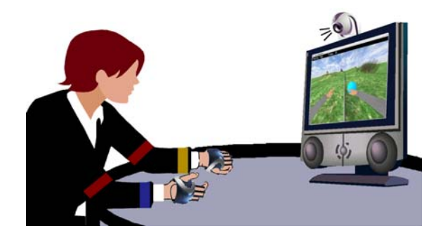
Figure 1 The Rehabilitation Gaming System. The subject faces a screen; on the display, two virtual arms mimic the movements of the user's arms that are tracked by means of a vision based motion capture system. Data gloves are used to capture finger movement.

The system integrates different elements. For the development of the virtual scenarios we used the Torque Gaming Engine (www.garagegames.com), which is versatile allowing easy adaptation to other rehabilitation scenarios. To capture arm movements, a vision based motion capture system (AnTS) detects color patches located in specific points of the real arms, i.e., wrist and elbow (Figure 1). For this application, the joint angles of both arms are computed from the position of the tracked patches. The computation of 8 joint angles from a single camera requires a perspective correction system plus a physical model of a skeleton in order to prevent the motion capture system to deliver unrealistic joint angles.