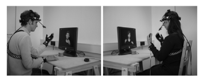
Figure 1. Avatar-mediated conversation with fully equipped participants

A typical setup of our current avatar platform is shown in figure 1. To guarantee a most natural nonverbal performance of the avatars the system makes use of state of the art capture technology for behaviour tracking.