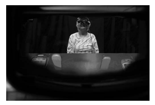
Figure 1. A photograph taken from the see-through HMD in the AR condition. The cellular phones on the table were virtual objects but the confederate and environment were directly visible and unmediated.

For the AR environment (see Figure 1), subjects directly experienced a simply black room where a set of virtual cell phones was present on physical table. Across the table was a partner, a confederate of the experimenter, directly visible and also wearing a head-mounted display. In the VR version of this environment (See Figure 2) all aspects of the visual environment were virtual. An avatar of the partner was presented in a virtual black room with a matching virtual table. In both cases, the participants interacted with the same female confederate.