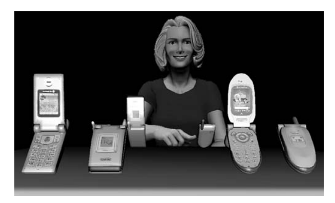
Figure 2. Stimulus material displayed to the participant in the VR environment. In this environment, user's body is not visible. The cellular phones, partner, and environment are all mediated and virtual. The virtual partner was a full body avatar puppeteered by the confederate.