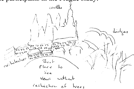
Figure 2: A typical sketch map from the Prague Study

The sketch maps drawn by the participants in the Prague study contained a great deal of detail. The buildings, landmarks and other physical aspects of the environment were very descriptively drawn with the shapes and types of buildings made evident. Particularly most of the maps highlighted the cathedral, cityscape, statue, walkways/paths, monastery, hillside, platform and trees, along with labels identifying their names. Figure 2 is an example of the kind of sketch maps that were drawn by the participants in the Prague study.