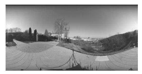
Figure 3: Viewpoint Mosaic created for the Head Mounted Display

The BENOGO VR (Figure 3) environment was a representation of the viewpoint in Prague rendered using BENOGO's real-time IBR (image based rendering) software. The system in itself comprises six networked computers running as a cluster, a head mounted display (HMD) and eight speakers providing surround sound. The system is set up in a darkened room where all of the participants take part in the studies.