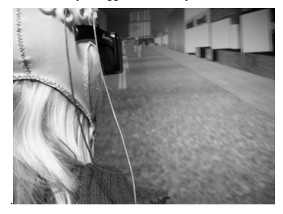
Figure 3: a BCI subject in the virtual street scene.

BCI control was as follows: if the trigger indicated that the user could walk, the user had to imagine foot movement to move forward. If the trigger indicated that the user should stop, they had to imagine right hand movement. If the classification indicated hand imagery when ordered to walk, the user would stay in place. If the classification indicated foot imagery when ordered to stop, the user would go backwards. This punishment was introduced so that the subjects will not be able to adopt a strategy of always imagining their foot. The same timing as in the rotation experiment was used, but instead of rotating, the BCI updates moved the subject by 0.05 distance units, so the total distance per trigger could be up to four units