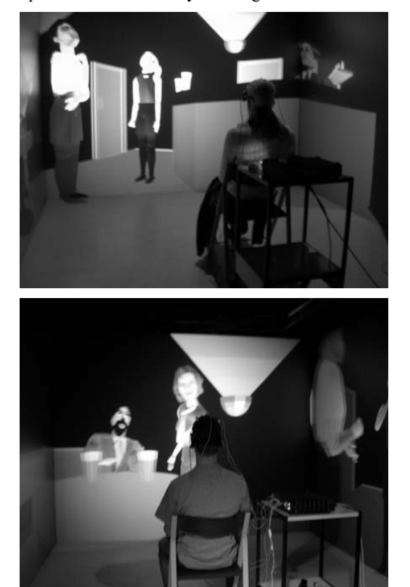
Figure 2: Two images of a subject connected to the BCI, wearing shutter glasses, in the virtual bar VE in the VR Cave room. Using only his thoughts, the subject can rotate the VE to pay attention to different characters in the bar.

The BCI sent 80 classification results over a period of 4.16 seconds, in fixed intervals. These results were used by the VR to provide continuous feedback; the total rotation per trigger could be up to 45 degrees, and for each BCI update the VE rotated by 0.56 degrees.